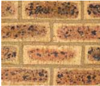
MEADOW RUSTIC FBS (SANS 227:2007) (ISO 9001:2008) Format: Imperial Phesantekraal Factory – Western Cape