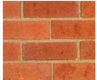
TOKAI RED TRAVERTINE FBS Format: Imperial Phesantekraal Factory – Western Cape