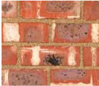
OLD CAPE RED SMOOTH FBA Format: Imperial Clay Industry