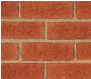
DE HOOP RED RUSTIC FBS (SANS 227:2007) (ISO 9001:2008) Format: Imperial De Hoop Factory – Western Cape