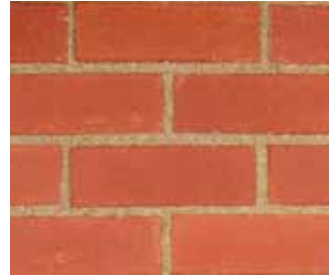
DE HOOP RED SMOOTH FBS Format: Imperial De Hoop Factory – Western Cape