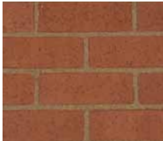
DE HOOP RED TRAVERTINE FBS Format: Imperial Available in special shapes De Hoop Factory – Western Cape